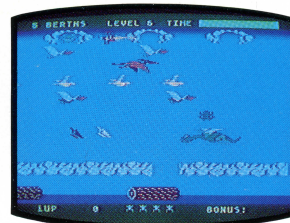
Atari Home Computers