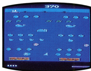
Atari Video Computer System

* designates a trademark of Sega Enterprises, Inc. FROGGER game graphics © 1984 Sega Enterprises, Inc. THREEDDEEP! is a trademark of Parker Brothers.