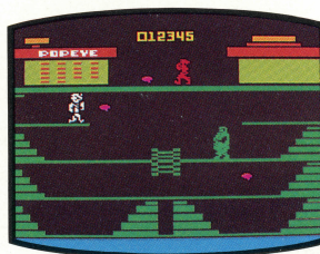
Atari Video Computer System